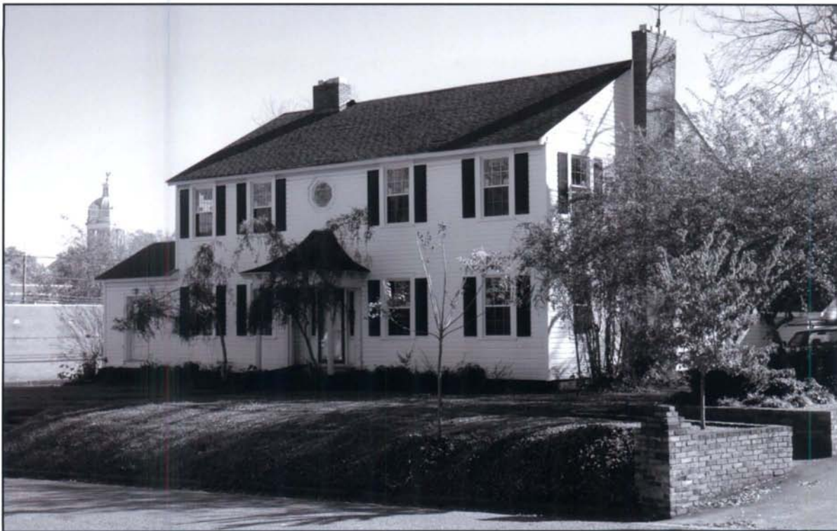
Houston Historic District Houston, Chickasaw County, MS