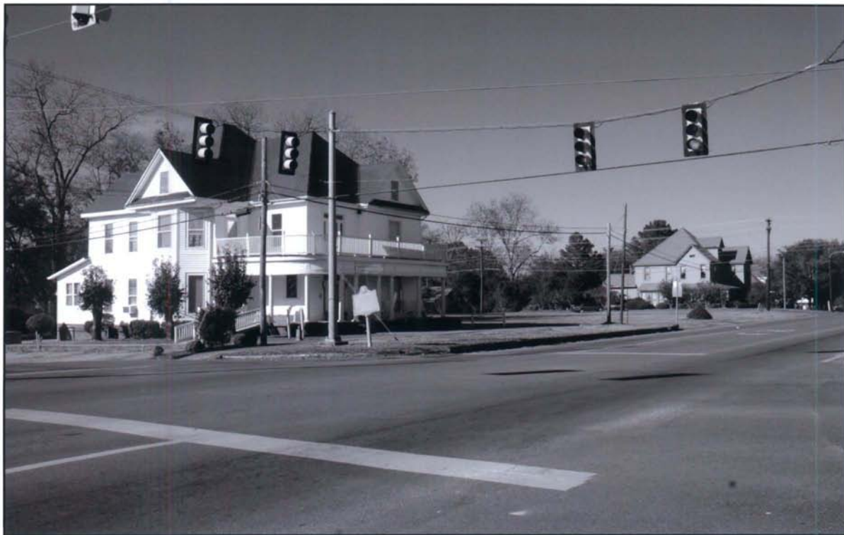
Houston Historic District Houston, Chickasaw County, MS