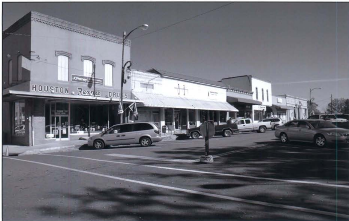
Houston Historic District Houston, Chickasaw County, MS