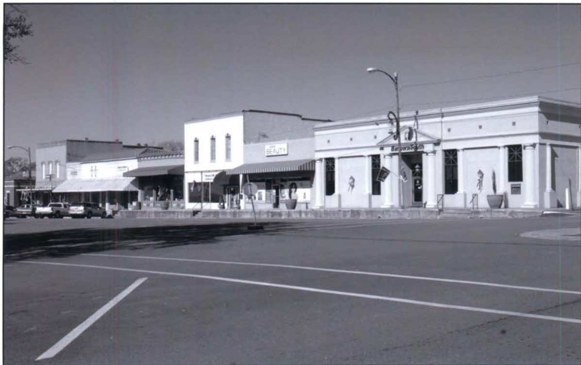
Houston Historic District Houston, Chickasaw County, MS