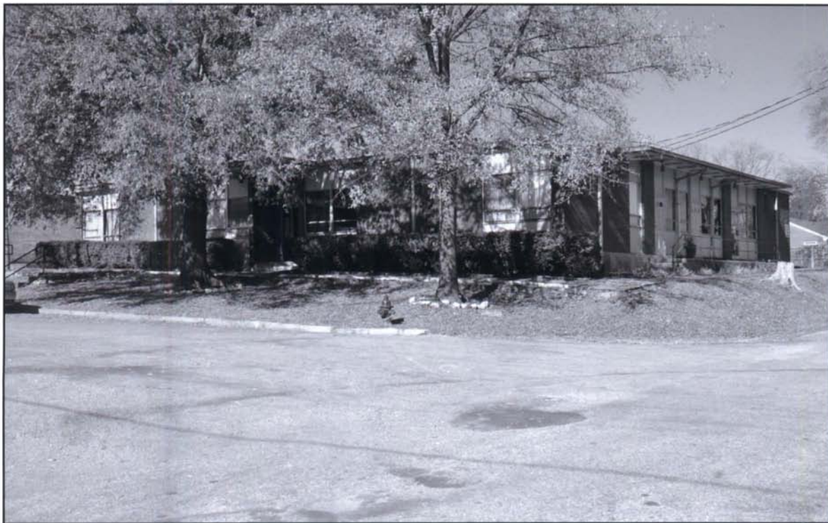
Houston Historic District Houston, Chickasaw County, MS