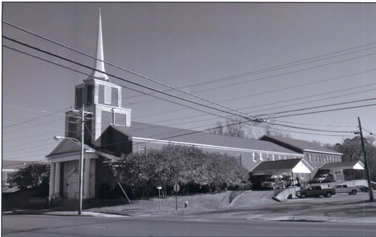
Houston Historic District Houston, Chickasaw County, MS