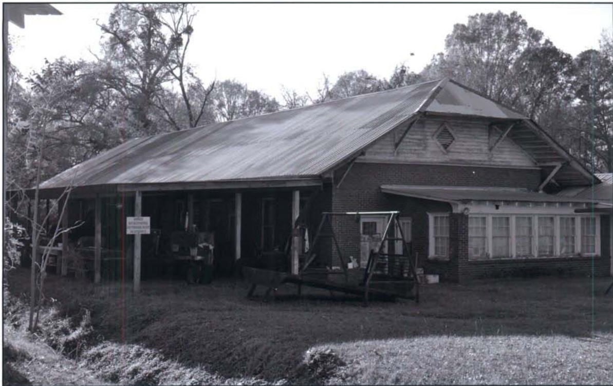
Houston Historic District Houston, Chickasaw County, MS November 2012 411 E. 6th St., Anniston AL 36207