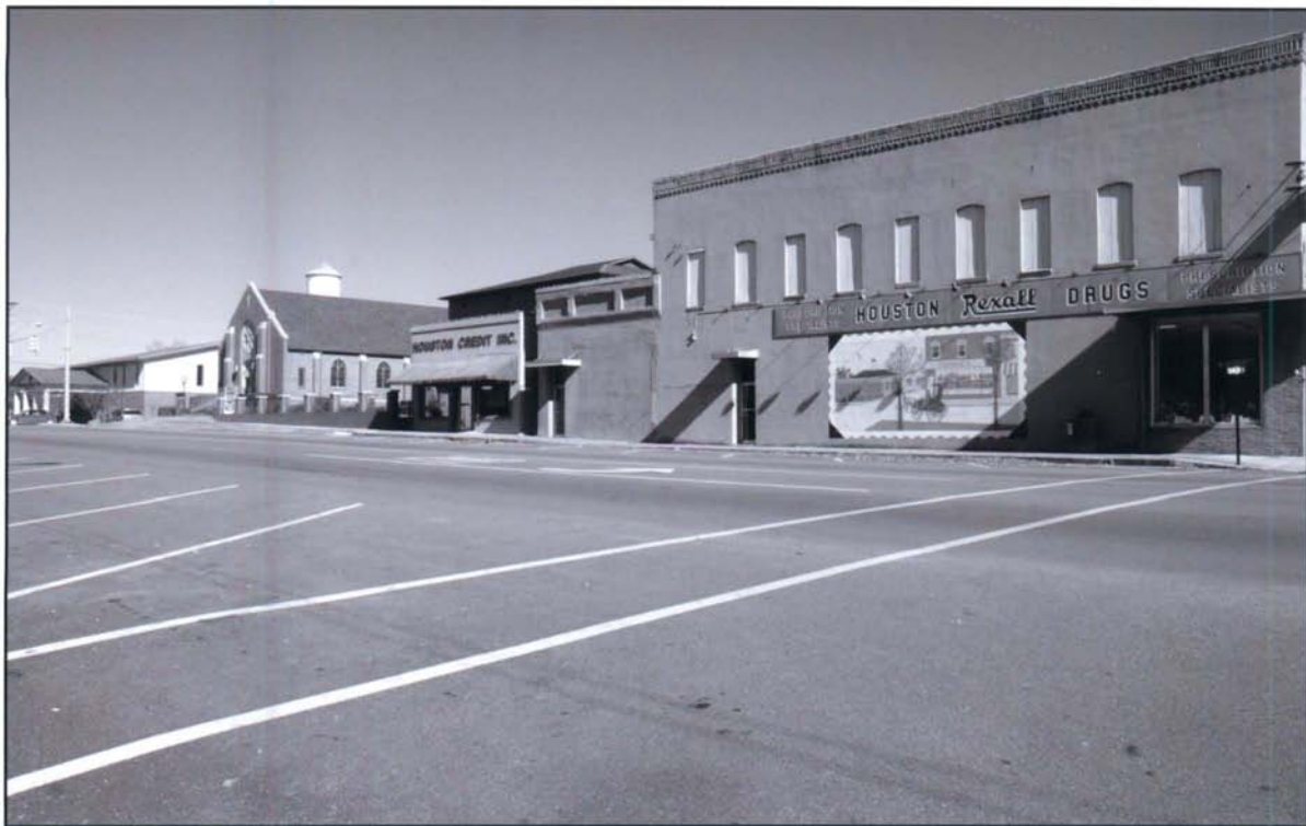
Houston Historic District Houston, Chickasaw County, MS November 2012 411 E. 6th St., Anniston AL 36207