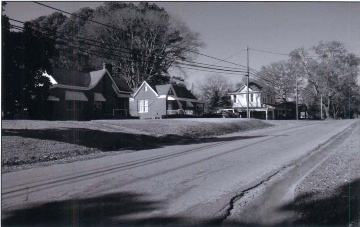
Houston Historic District Houston, Chickasaw County, MS November 2012 411 E. 6th St., Anniston AL 36207