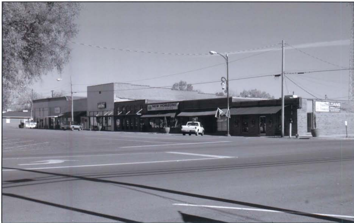
Houston Historic District Houston, Chickasaw County, MS