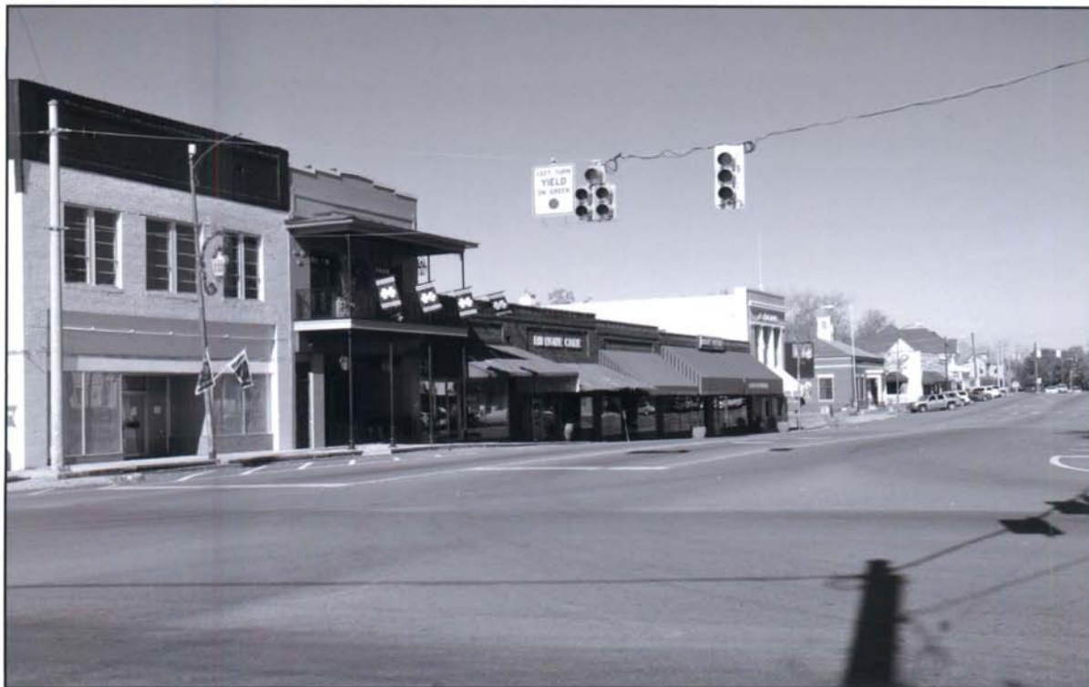
Houston Historic District Houston, Chickasaw County, MS