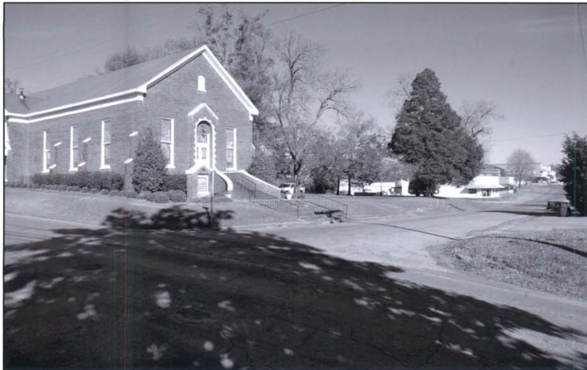
Houston Historic District Houston, Chickasaw County, MS