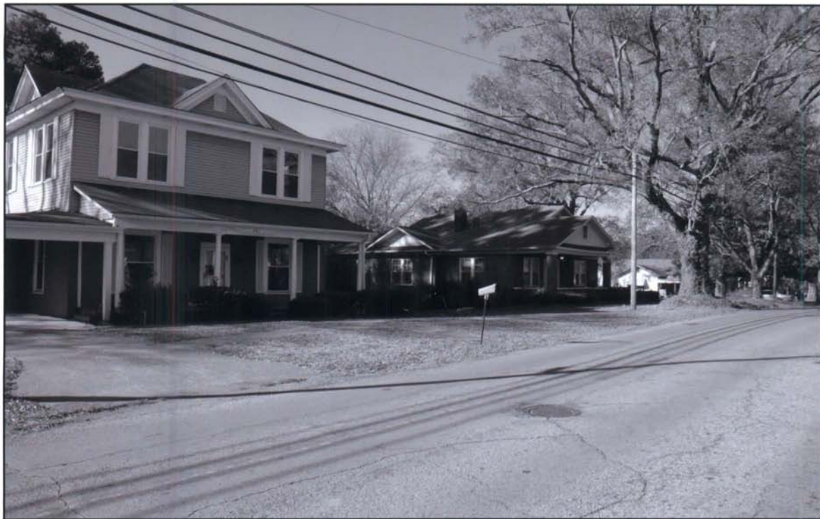
Houston Historic District Houston, Chickasaw County, MS