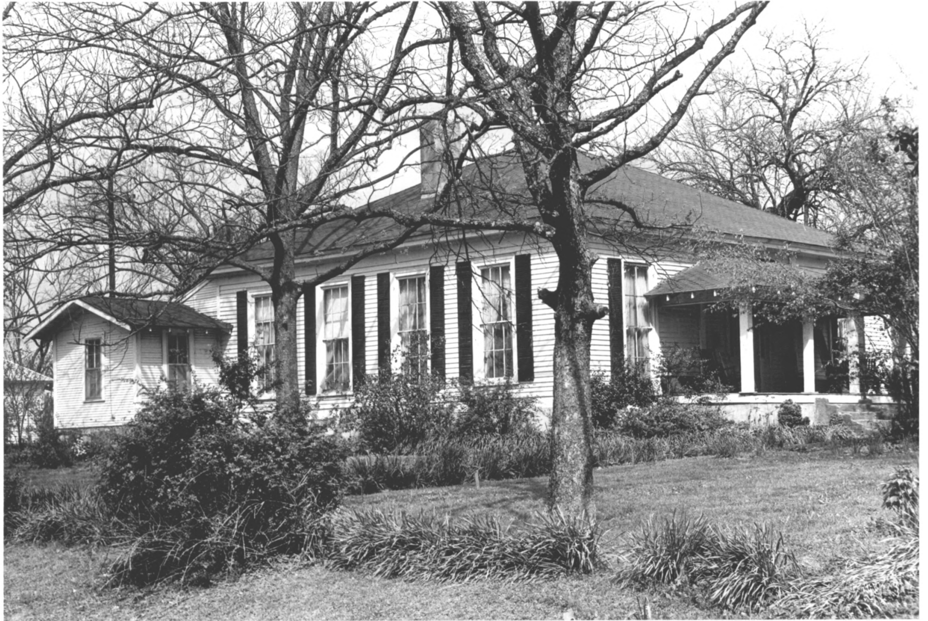
L. Q. C. Lamar House, Oxford, Mississippi