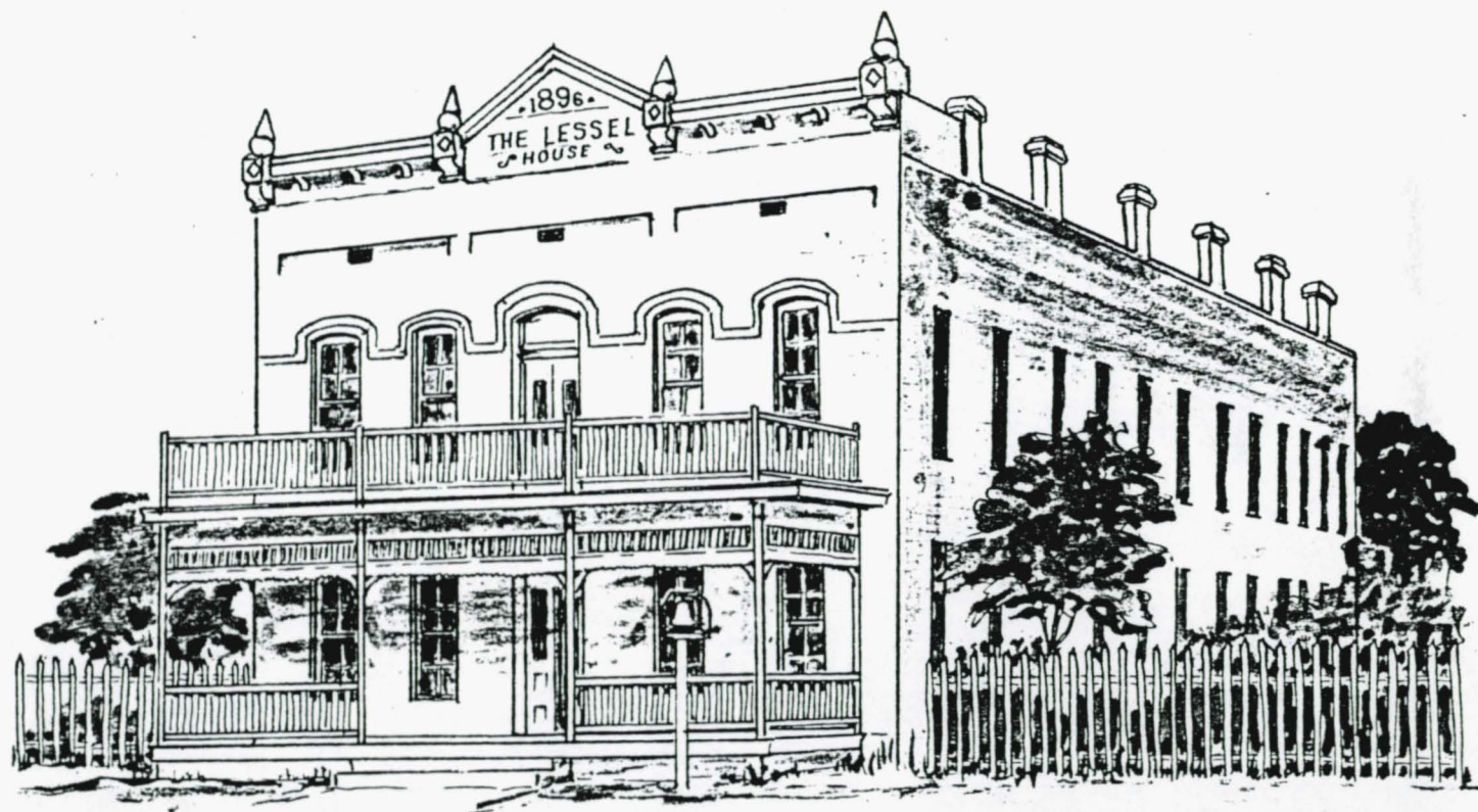
Drawing made from an early photograph of the building showing the original porch.