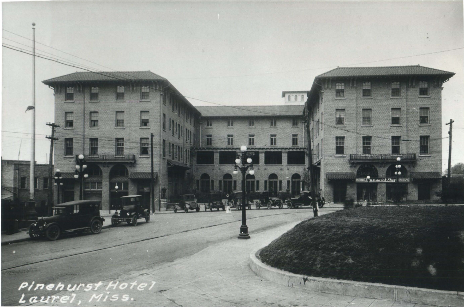
Pinehurst Hotel Laurel, Miss.