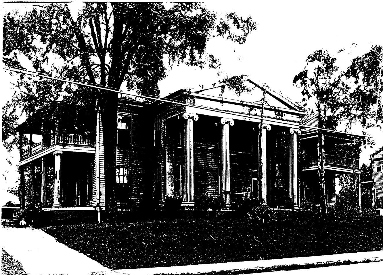
Historic View 1 of 2:

Poindexter Historic District Jackson, Hinds County, MS Date: Ca. 1950s